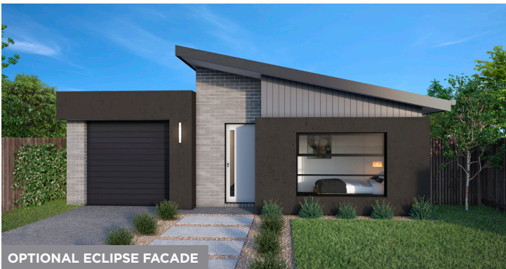
OPTIONAL ECLIPSE FACADE