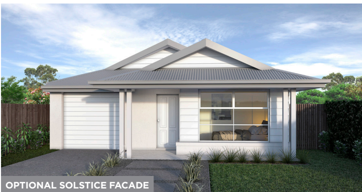
OPTIONAL SOLSTICE FACADE