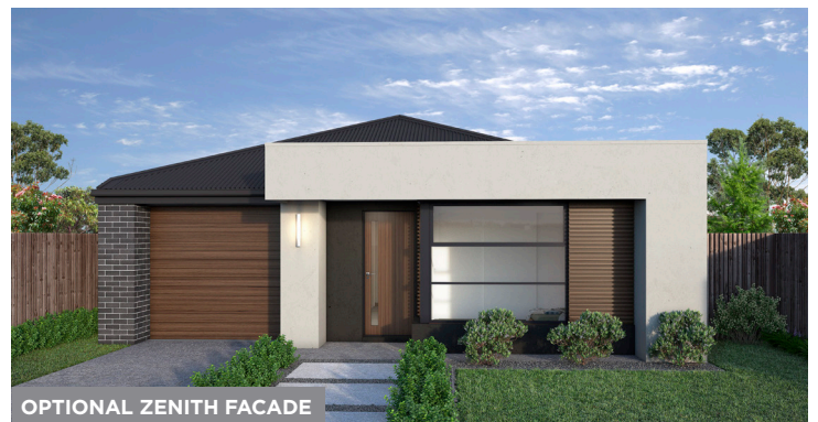
OPTIONAL ZENITH FACADE