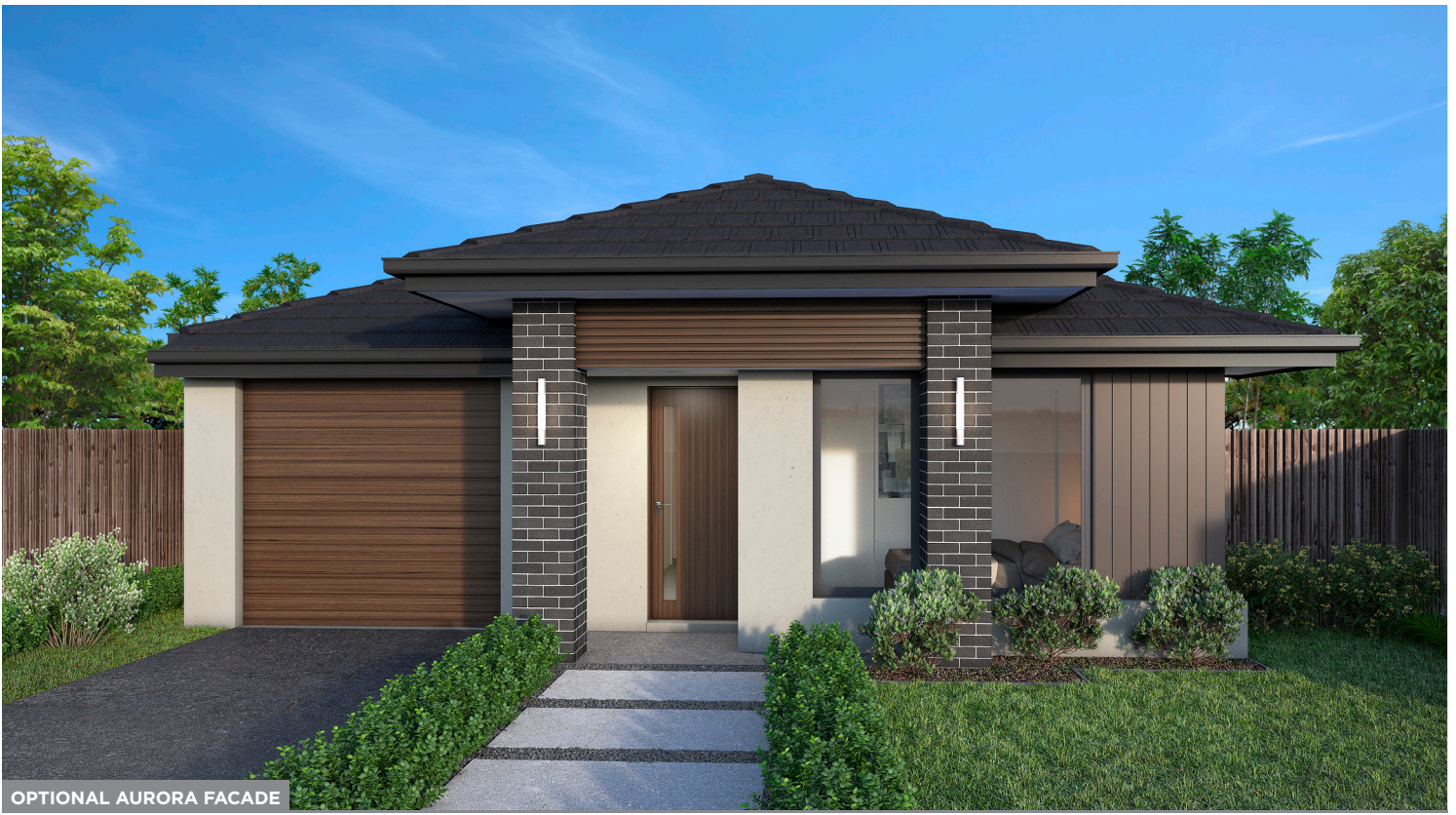
OPTIONAL AURORA FACADE